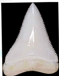
Great White Shark Tooth.

Look carefully for the serrated edges, which help it bite and tear its food.